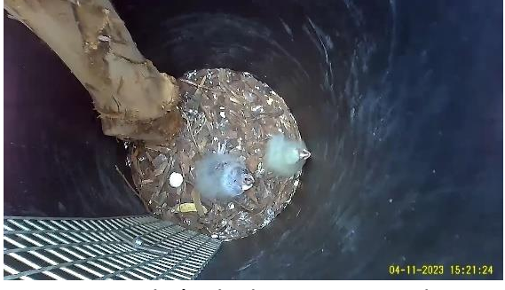
Two Carnaby's chicks in nesting tube