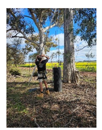
Installing the artificial nesting tubes