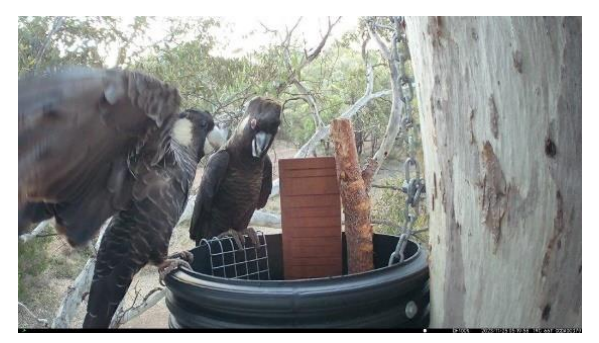
Two Carnaby's perched on nesting tube